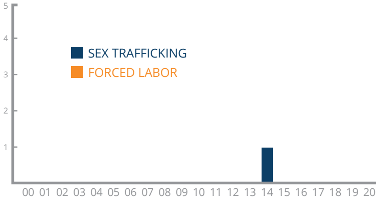
NEW CRIMINAL HUMAN TRAFFICKING CASES